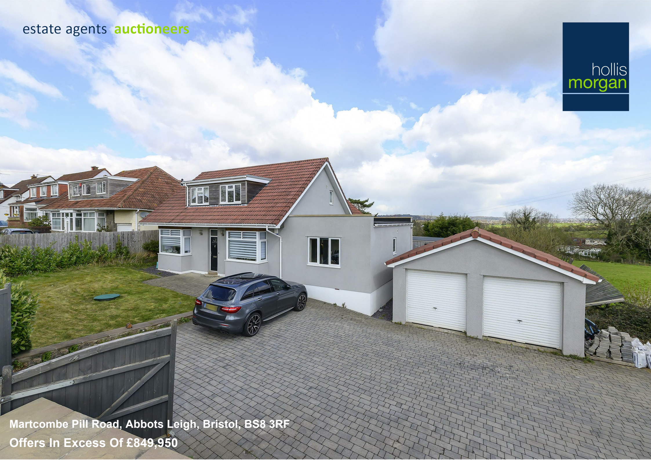
Martcombe Pill Road, Abbots Leigh, Bristol, BS8 3RF Offers In Excess Of £849,950